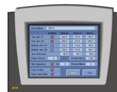
Temperature and pressure calibration screen